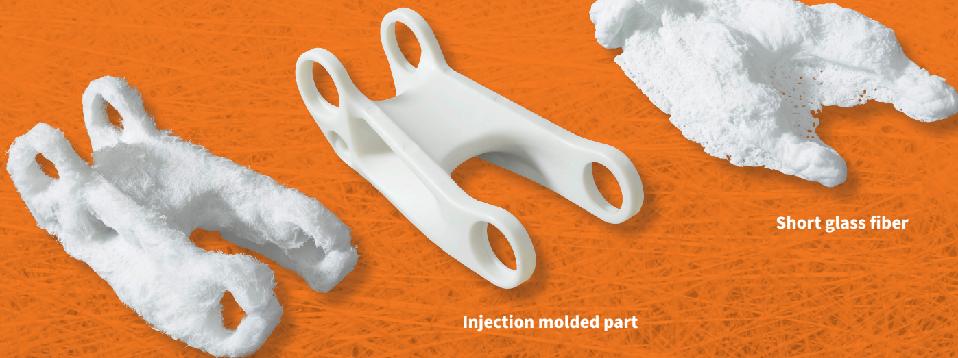
Long glass fiber

Entanglement of longer fiber filaments allows the long fiber part to retain its molded form, which provides more structural integrity and increased toughness.